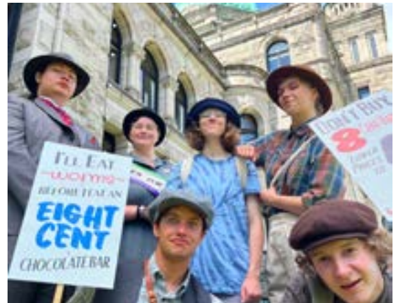
Parliamentary Players, 2024

We are now back to our regular business hours, providing free guided tours and self-guided tours on weekdays from 8:30 a.m. to 4:30 p.m. With the 2024 election underway, we expect an increase in school tour bookings. We continue to offer different engaging educational opportunities both virtually and in person.