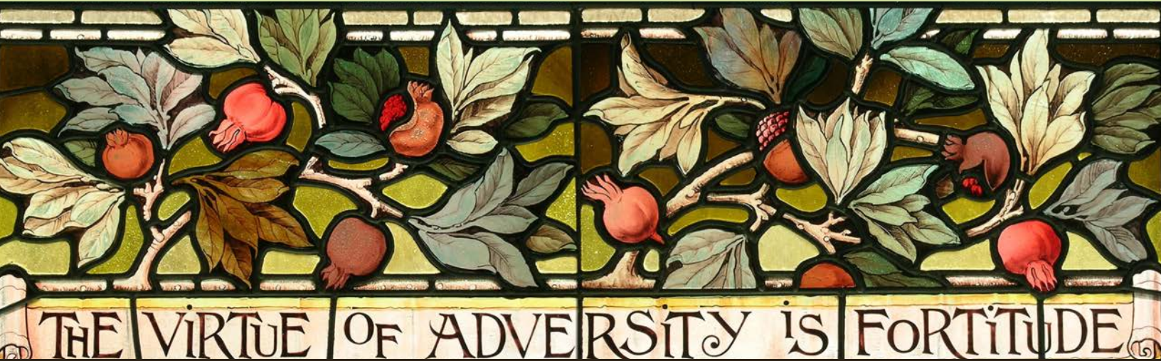
Stained glass window, Parliament Buildings